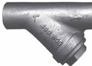
Solder (Sweat) Type Model YS53