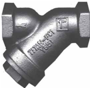
Screwed Type, Model YS51