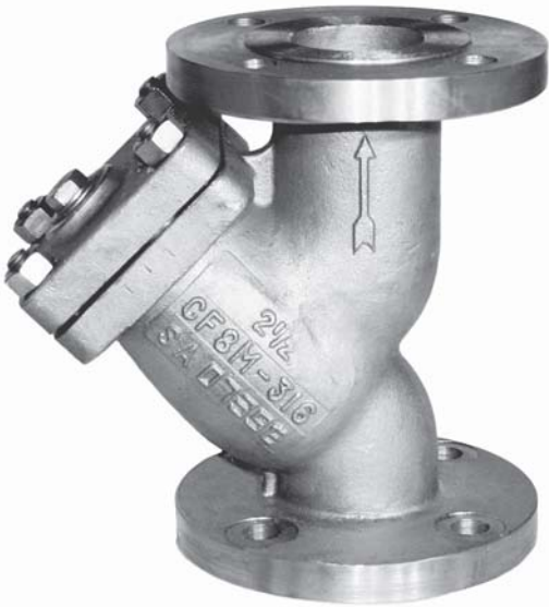
2 1/2" YS 61-SS