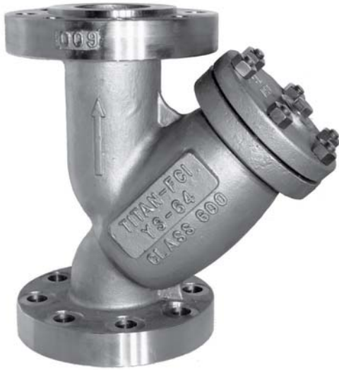
3" YS 64-SS