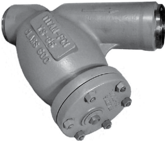
3" YS 65-CS

Class 600 lb • CARBON STEEL & STAINLESS STEEL